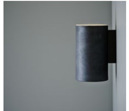
Earth Light, Wall Mount, Regular – Charcoal