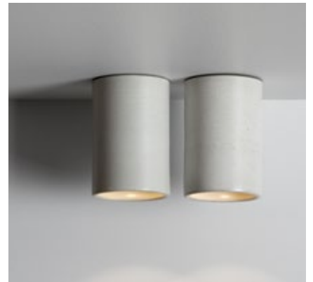
Earth Light, Ceiling Mount – Speckled White Satin

The Earth Light has been designed in wall, pendant and ceiling mount formats. The elemental geometric form is both simple and architectural; all fittings are thrown on a potter's wheel giving each light a unique quality and a surface rich with the evidence of its handmade process.