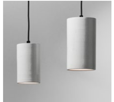
Earth Light, Pendant, Regular and Large – Speckled White Gloss