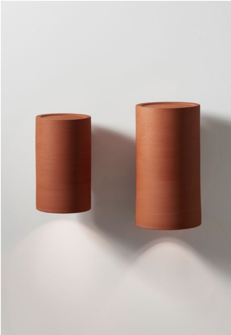
Earth Light, Wall Mount, Regular and Large – Speckled White Gloss