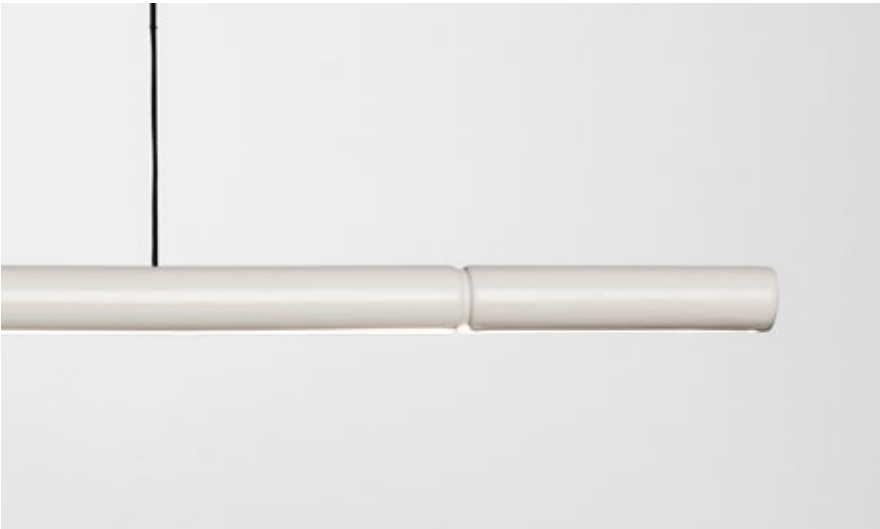
Potter DS, Pendant, 1800 – DS White