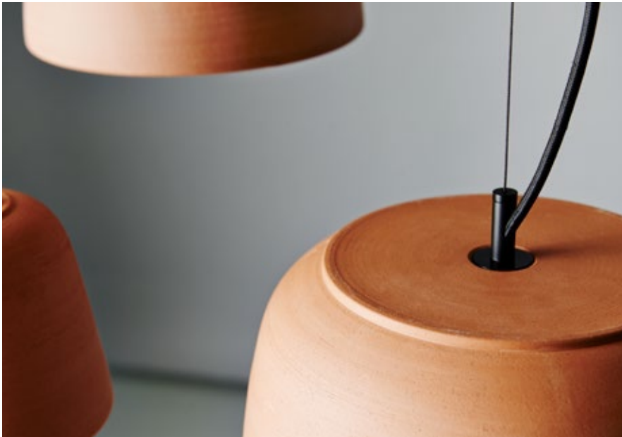
Potter Light, Medium – Terracotta