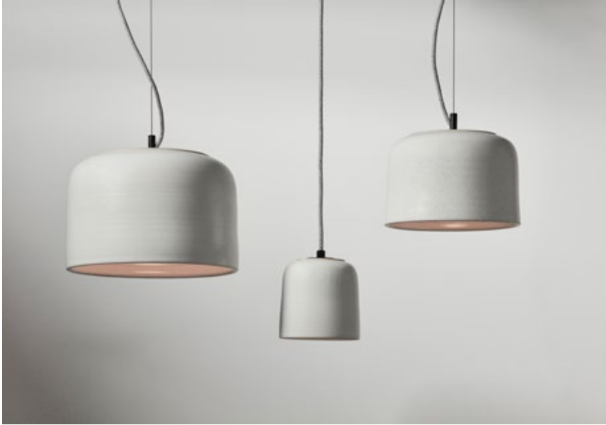
Potter Light, Large, Small, Medium – Speckled White Satin