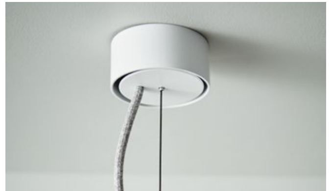
White Ceiling Canopy, Flex Option – Mid Grey Linen

Handmade to the same size and shape specifications as the other fittings in the Potter Light family, the Potter Halo is thrown on a potter's wheel using a specially formulated, high-grade porcelain. Sourced from a producer in Australia, the porcelain used to make the Potter Halo is internationally regarded as one of the finest in the world. Its highly refined nature produces a semi-translucent surface that glows softly when illuminated from within.