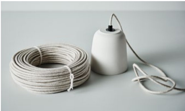
Flex Option – Natural Grey Linen