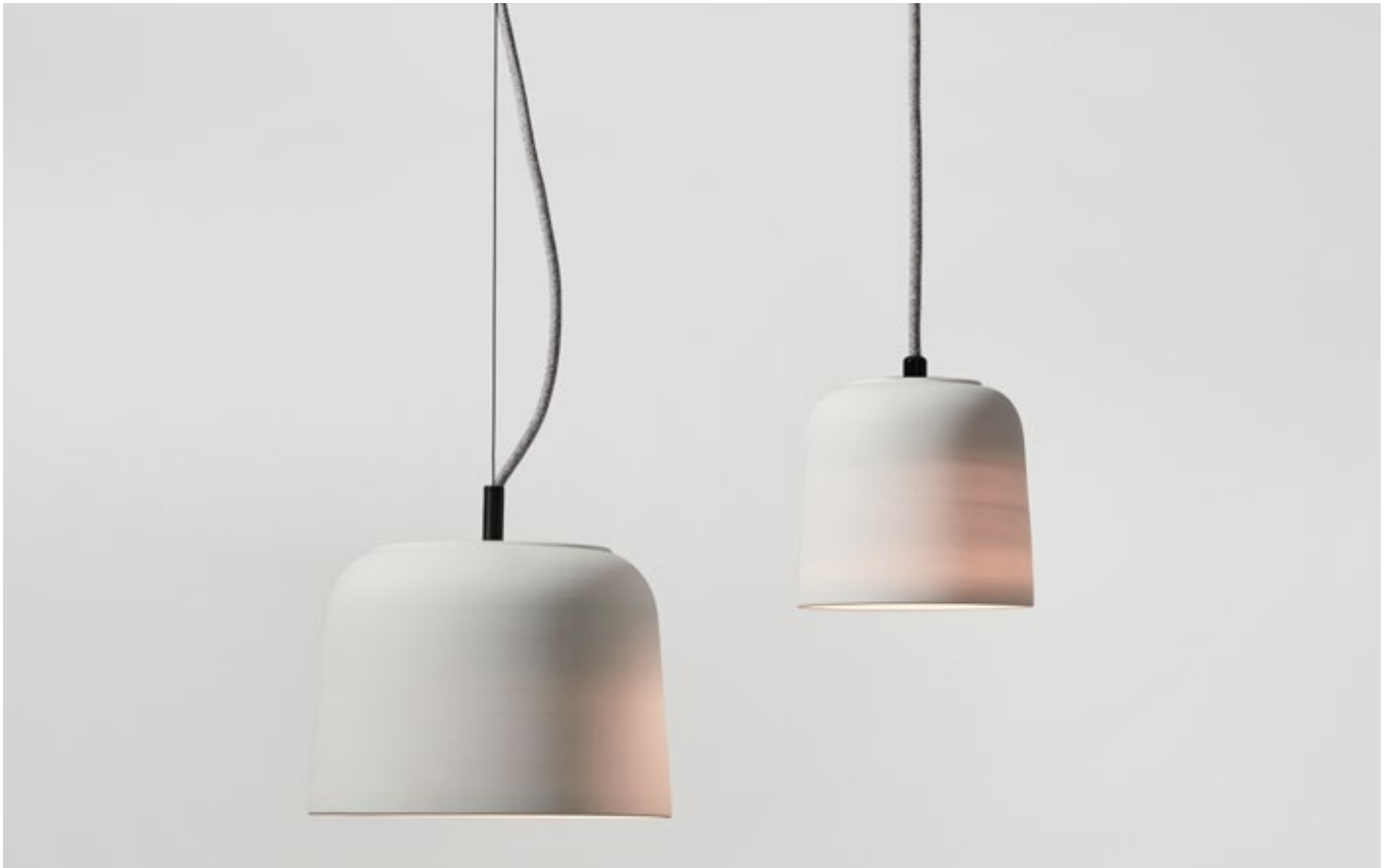
Potter Halo, Medium and Small – Porcelain