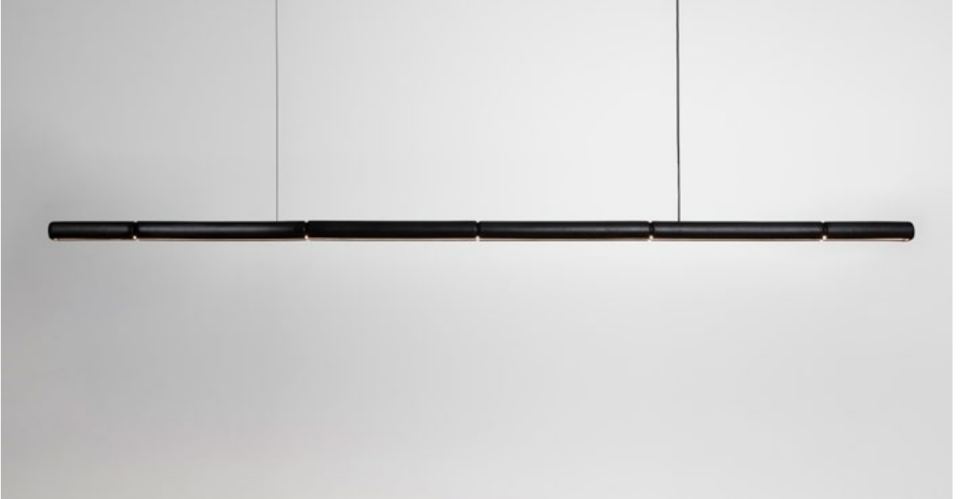
Potter DS, Pendant, 2250 – DS Charcoal