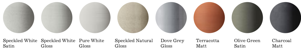
Speckled White Satin Speckled White Gloss Pure White Gloss Speckled Natural Gloss Dove Grey Gloss Terracotta Matt Olive Green Satin Charcoal Matt