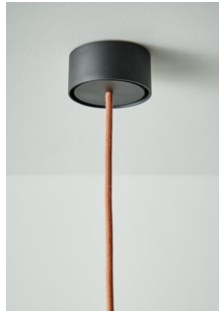
Black Ceiling Canopy, Flex Option – Deer Cotton

The elemental geometric form of the Potter Light range is both simple and architectural. Wheel thrown by a master potter, the fittings are made using a selection of high quality, Australian made stoneware and earthenware clays. Each of the fittings is imbued with the subtle differences in finish and form inherent in an authentically handcrafted object. The electrical componentry has been designed to complement the handmade nature of the ceramics.