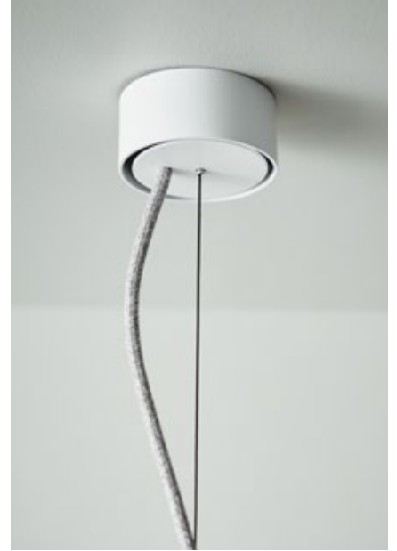
White Ceiling Canopy, Flex Option –Mid Grey Linen