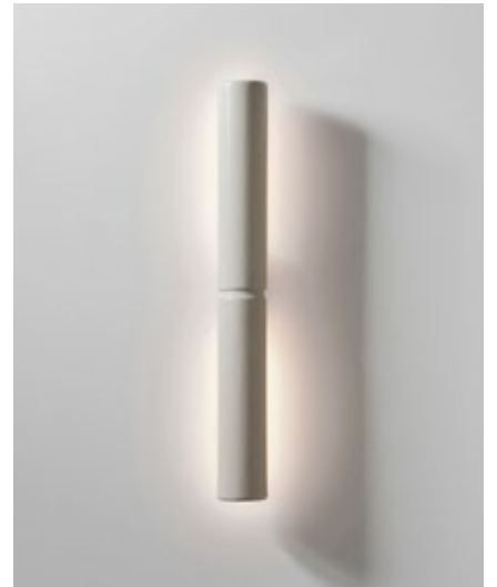
Potter DS, Wall Mount – DS White

Designed by Bruce Rowe for Anchor, the ceramic Potter DS wall and pendant lights are the outcome of a creative and technical collaboration with our long-term lighting partner, Rakumba Lighting and master potter, Michael Skewes. Designed and made using a hybrid process of traditional ceramic techniques and contemporary digital tools, the DS is simple and refined, focusing on the essential beauty of the ceramic form to direct and reflect light. The external simplicity of the handmade ceramic form houses integrated aluminium and acrylic extrusions and a resolved LED lighting solution.