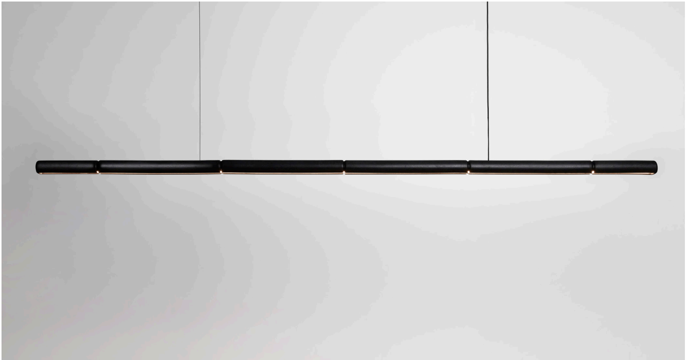
Potter DS, Pendant, 2250 – DS Charcoal