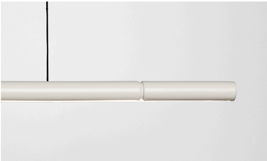
Potter DS, Pendant, 1800 – DS White